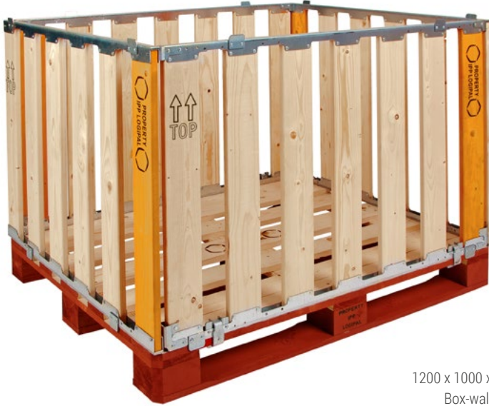
1200 x 1000 x 800 mm Box-wall 800 mm