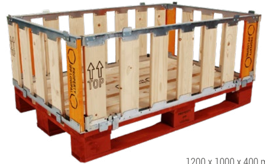
1200 x 1000 x 400 mm Box-wall 400 mm